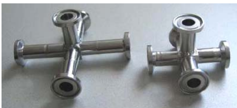
Figure 1. Half inch sanitary 5-way flow diverters.

A complete "Spider" assembly consists of two sanitary 5-way flow diverters, eight 90° elbows and 18 clamps and gaskets as demonstrated in Figure 2B. Figure 1 shows a longer and a shorter version of the ½" sanitary 5-way flow diverters which are the key components of a "Spider" assembly. Both flow diverters have the same height but different arm length. The function of the flow diverter is to evenly distribute the incoming fluid to four connected devices. Each BC25 capsule is connected to one arm of a sanitary 5-way flow diverter through a 90° elbow and clamps. The longer version of the 5-way flow diverter is designed to be used with the 90 mm disc holders, and the shorter version of the flow diverter with the 47 mm disc holders.