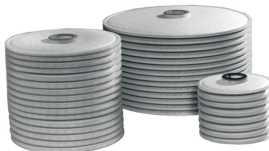
Figure 2 — Zeta Plus™ Filter Cartridges

Zeta Plus depth filters are commonly used for initial clarification of cell culture broth and cell lysates. These filters contain significant voids volume (hence the name depth filter) which allow for accumulation of cellular debris. The filter structure is a series of interconnecting pore pathways able to retain cellular debris by mechanical entrapment. In addition to debris removal by mechanical retention, Zeta Plus filters are also able to remove particles smaller than their pore size. This capability is based on electrokinetic attraction of negatively charged particles by the positively charged filter surfaces. It was anticipated that DNA, which is a polyanionic molecule, would also be removed by Zeta Plus filters.